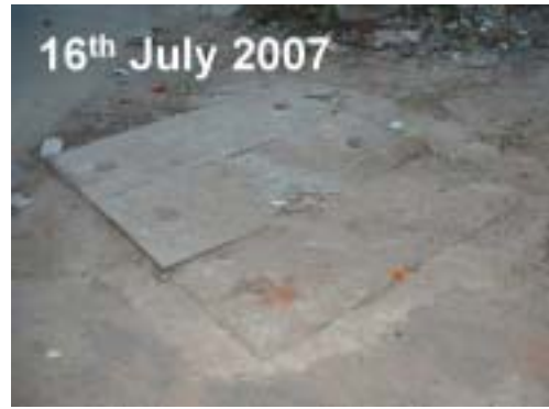
16 th July 2007