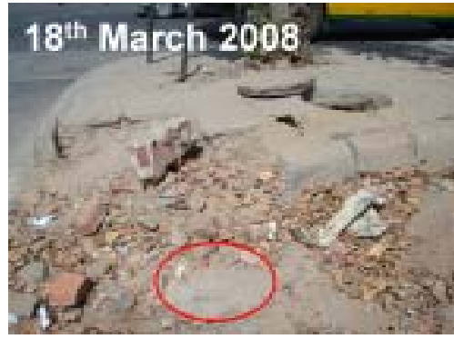
18 th March 2008