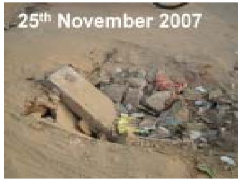
25 th November 2007