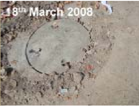
18 th March 2008