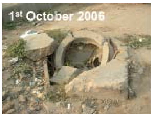
1 st October 2006