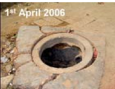
1 st April 2006