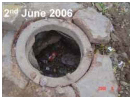
2 nd June 2006