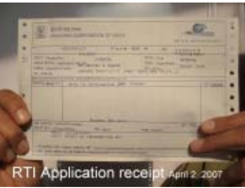
RTI Application receipt April 2, 2007